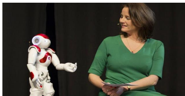
NAO interviews day chairman