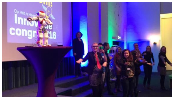
NAO during an innovation congress